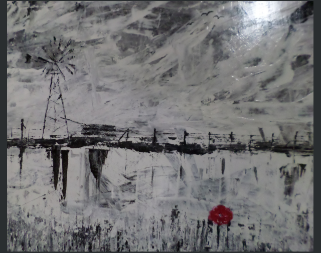
SOUTH AFRICA LANDSCAPES

082 4954 019 WESTERN CAPE GREYTON SOUTH AFRICA